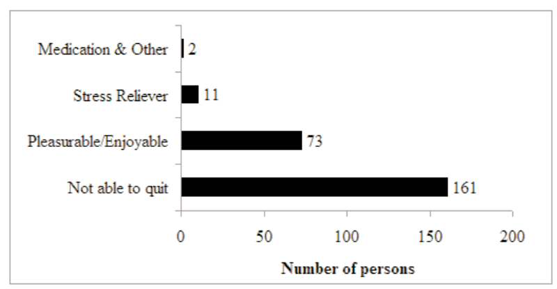
Figure 3: Reasons for continued smoking (n=281)

Despite of certain limitations like small sample, no differentiation by health centers, and lack of variance with respect to demographic variables due to entire population being from slum areas, in general the study adds important knowledge regarding tobacco epidemiology of the study area as limited data is available from the region. But for the extrapolation of results to wider population and for policy decisions larger sample survey in the region needs to be carried out.